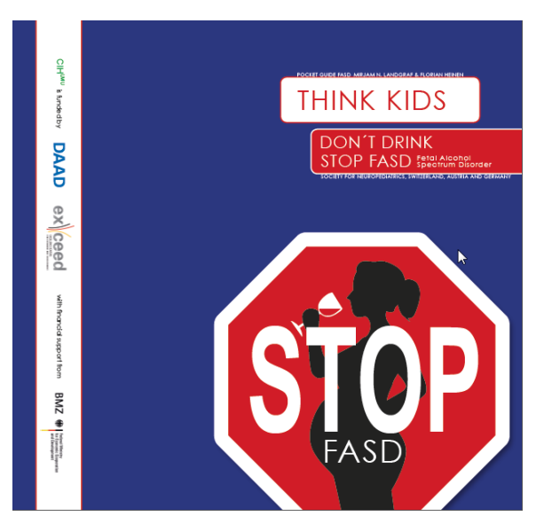
FASD pocket guide

For more information on FASD, please look at our website through the following <u>link</u>.